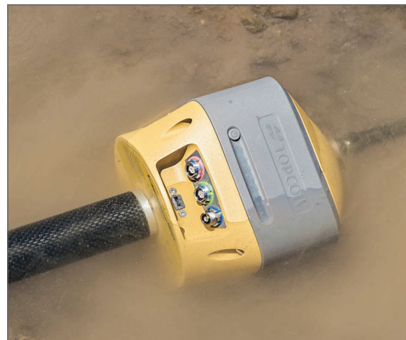
IP67 Waterproof Rating

Awkward shots on steep slopes or hard to reach spots are now a breeze with TILT™.