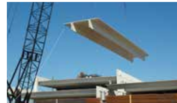
Prefabricated / Modular