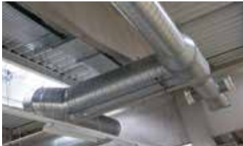
Mechanical / Plumbing